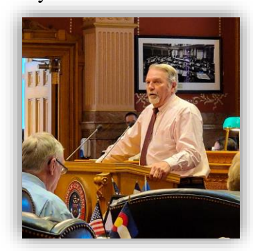
Pictured Above: Earlier this week, I went down to the Senate well to speak on SB23-303 during Second Reading.

I do not understand why we are still introducing new bills, bills that are over 50 pages in length, during this last week of session. If these bills are really of such high importance, why wouldn't they have been introduced earlier so that way we can fully address them, get stakeholders involved, and have a more transparent process. One of these bills was SB23-303, which was just introduced this past Monday and has been forced full speed through the process – having already passed through the Senate, and it will be voted on by the House soon.